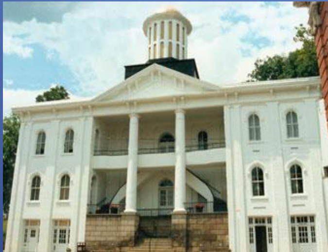
MEIGS COUNTY COURTHOUSE